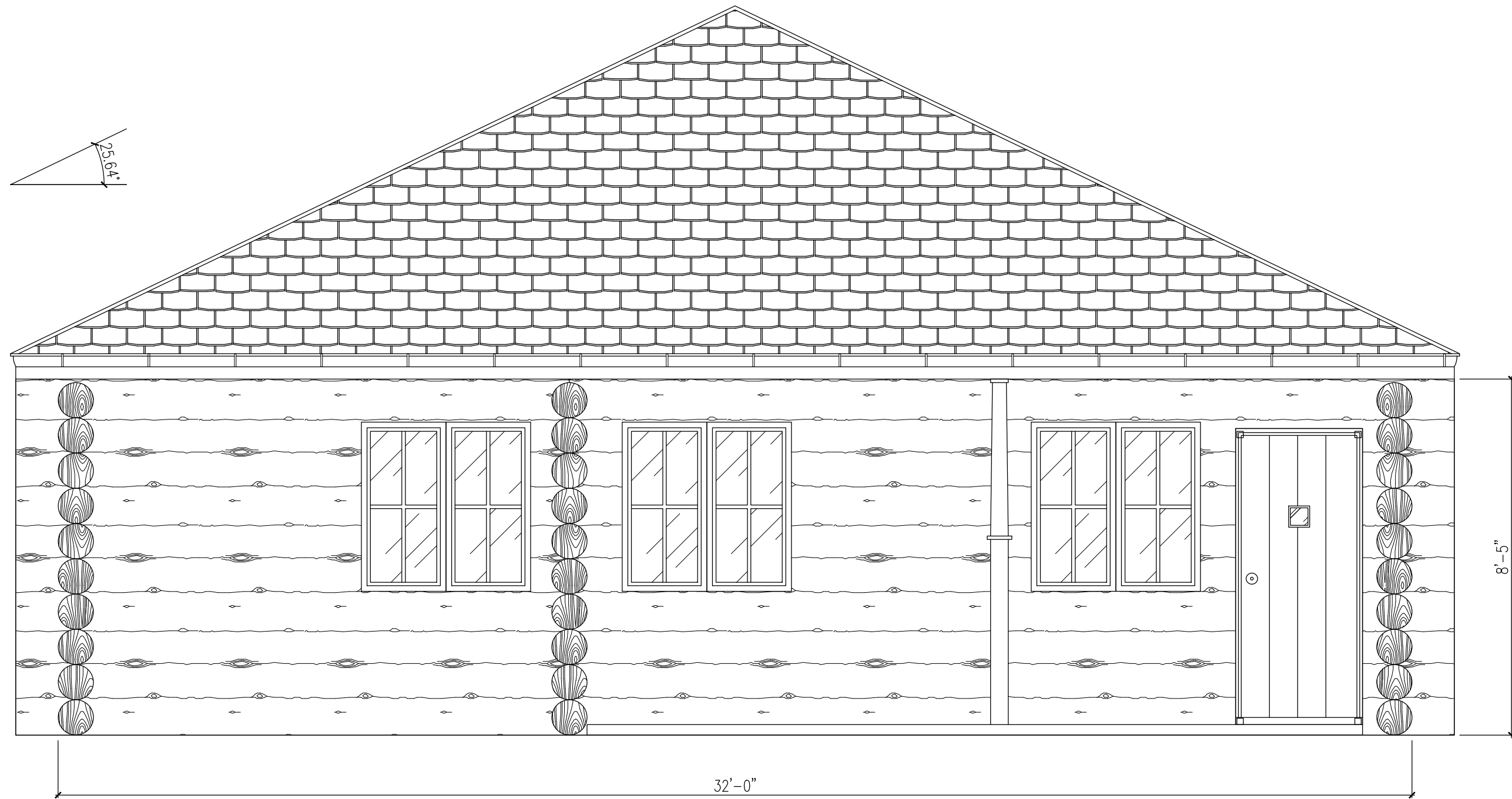
2 FRONT ELEVATION SCALE: 3/8" = 1'-0"